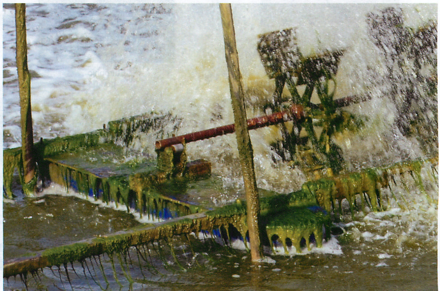
Blue greens on paddle wheels.

Given the nature of these bacteria, it is very unlikely that they can be eliminated entirely from production systems. The goal should however, be to manage around them and take proactive steps to reduce their numbers through whatever means there are available. Controlling the growth of these