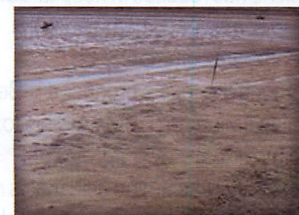
Clean ponds and water

Modifies pond ecology by competing against vibrios and blue green algae. Consulting for sustainability by shrimp and fish. Managing EMS/APHNS.