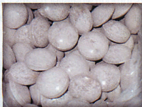
PRO4000X tablets with selected bacteria